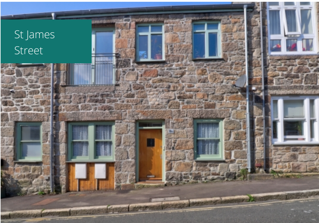
St James Street