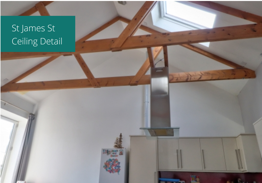
St James St Ceiling Detail