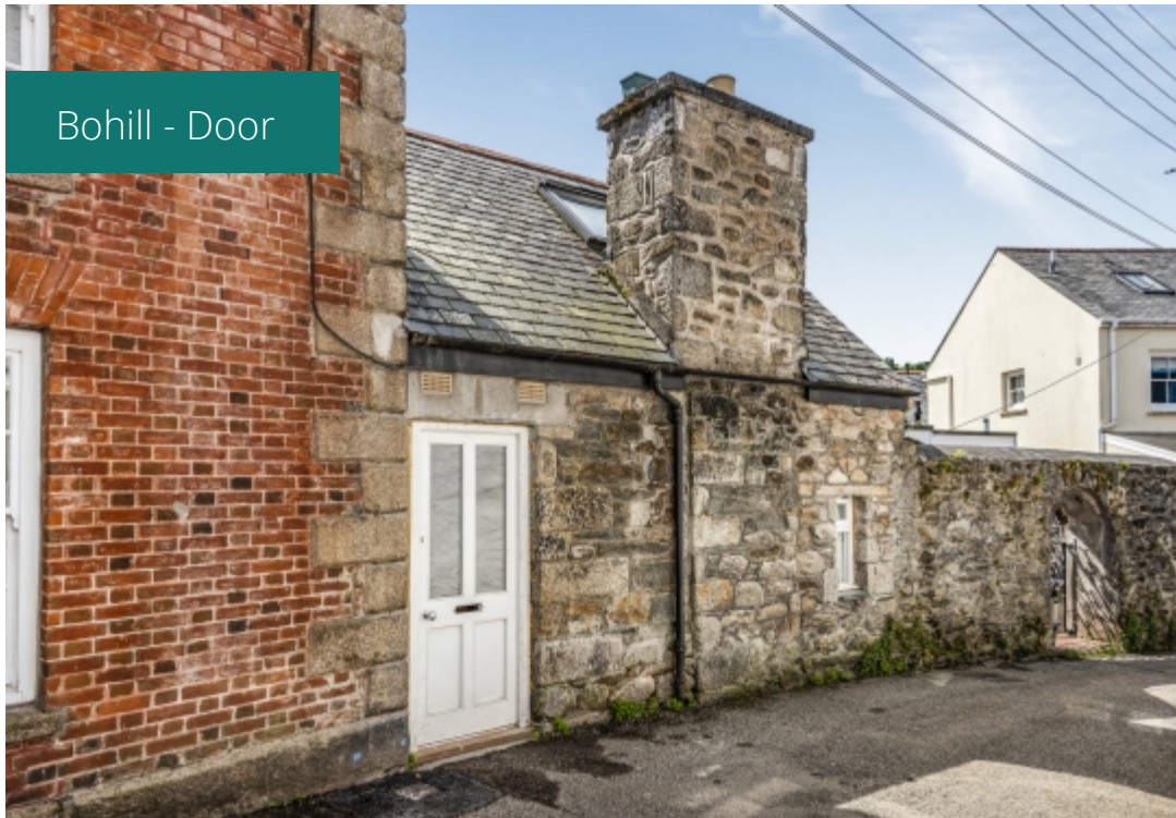
Bohill - Door