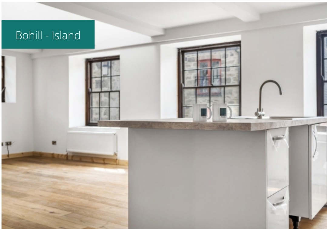
Bohill - Island