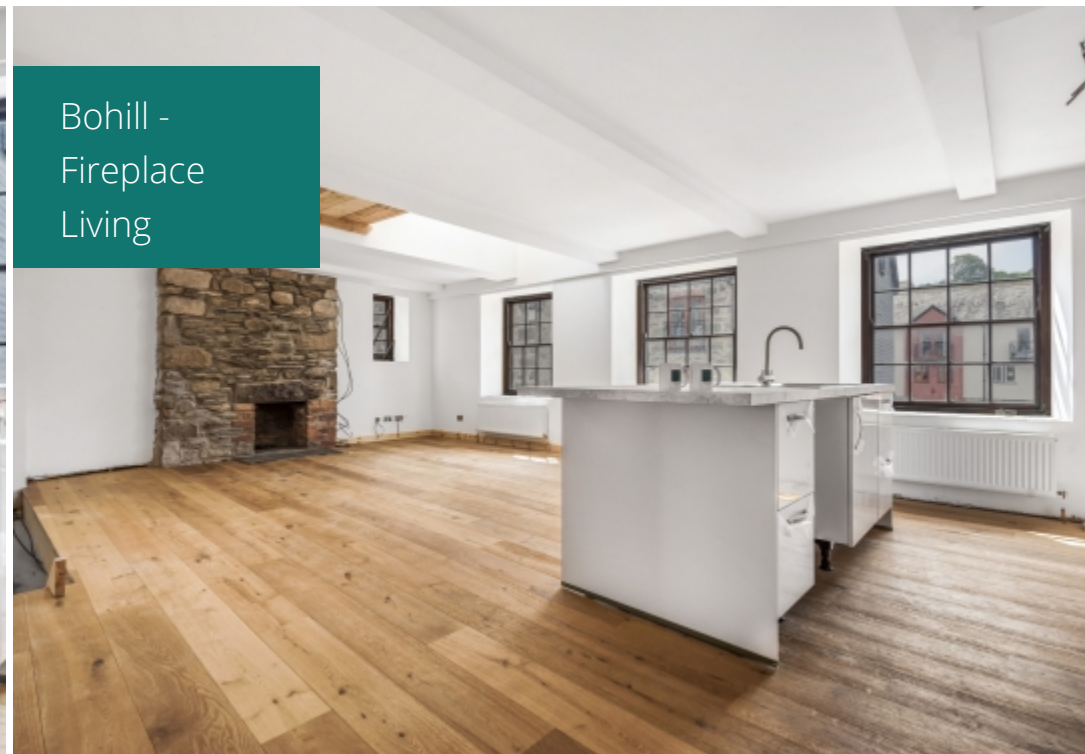
Bohill - Fireplace Living